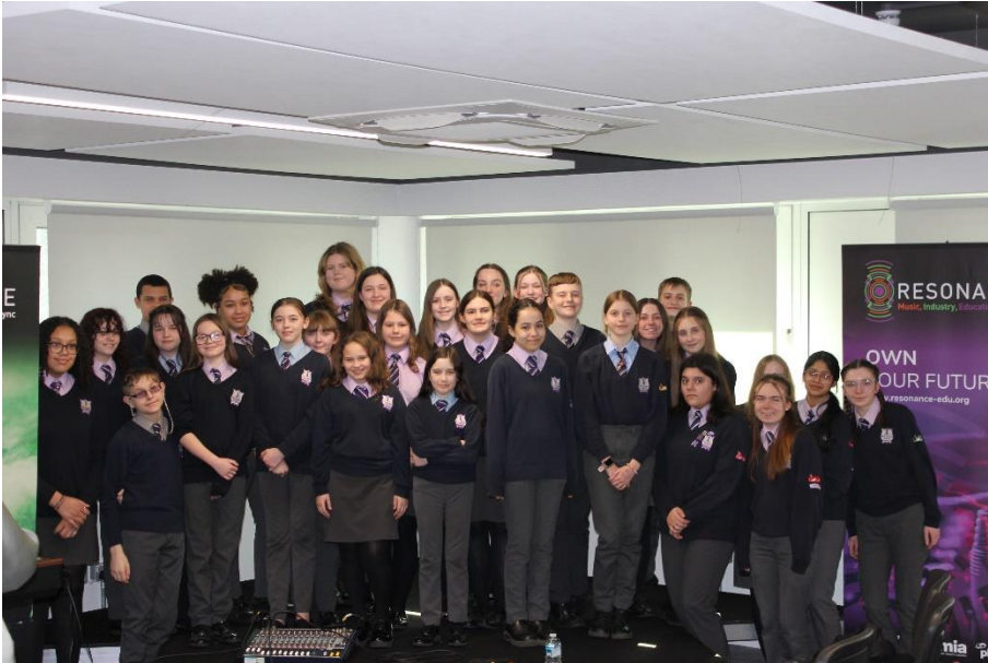
Dormston Choir at their final rehearsal.